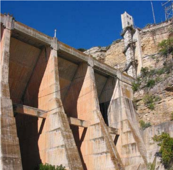
Possum Kingdom Lake dam

First, it's important to understand the total output of electricity that the facility generated. The hydroelectric facility at Possum Kingdom was designed to generate 24 megawatts (MW) of electricity. To put this in perspective, one must understand the total amount of electric capacity on the grid managed by the Electric Reliability Council of Texas (ERCOT), which carries 85% of Texas' total electric load.