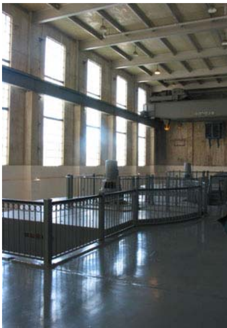
Interior of PK Hydroelectric Powerhouse

Should the hydroelectric units remain offline, the remainder of the water release capabilities (low flow and spillway) would still be operational. It is estimated that without the hydroelectric units in operation, in addition to these other methods for releasing water, there would need to be the capability to release up to 2,400-cfs in order to properly manage the system from a water supply standpoint to meet downstream requirements. The Authority is currently in the process of evaluating that issue at this time.