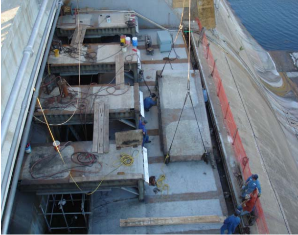
Possum Kingdom Lake gate replacement

replacement of spillway gates on the Morris Sheppard Dam, work that was required regardless of whether the hydroelectric facility continued to operate or not.