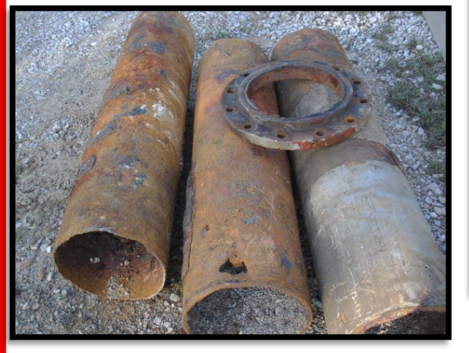
Segments of replaced pipe