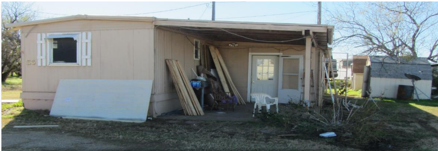
POSSUM KINGDOM LAKE (1000' CONTOUR)