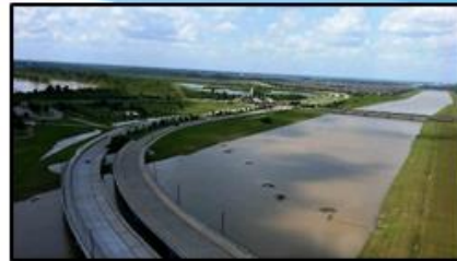
Ditch H in Sugar Land