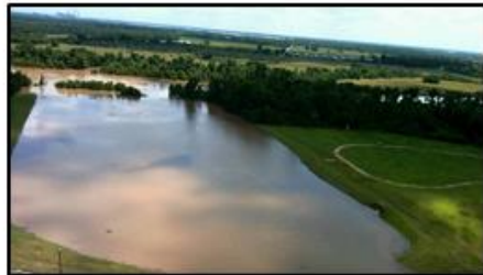
Brazos River in Sugar Land