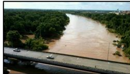
Alt 90A in Richmond