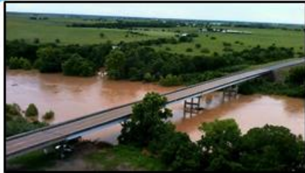
FM 1489 near Simonton