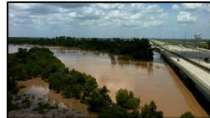
US 59 in Sugar Land