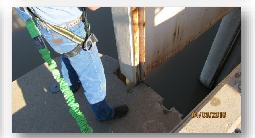
Meeting Date: April 25, 2016