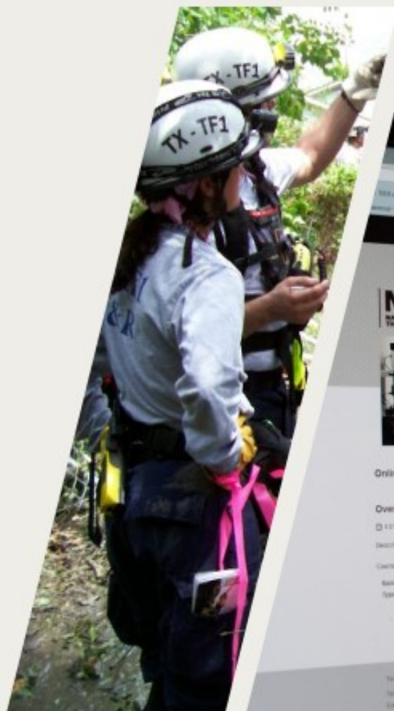
Disaster Response & Recovery