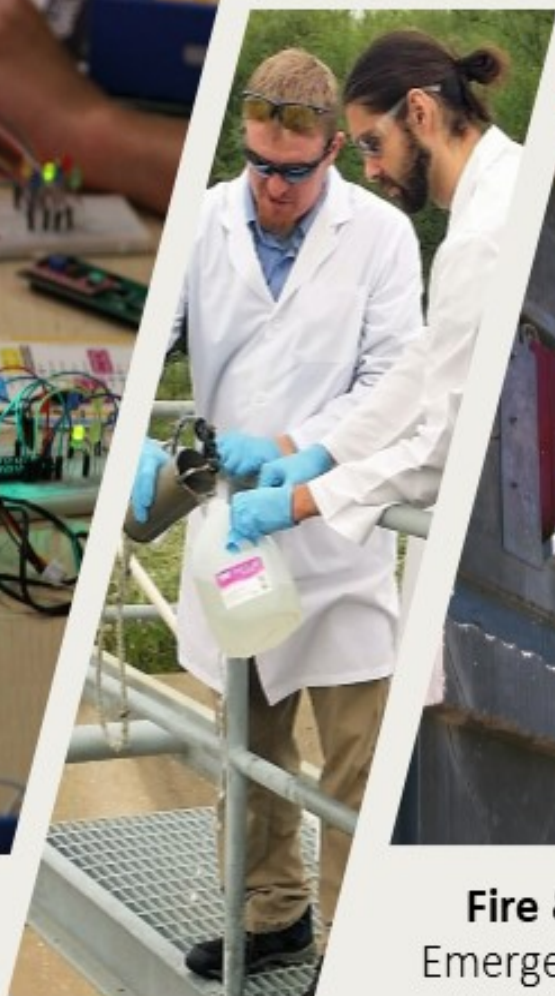
Infrastructure & Safety