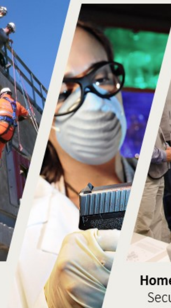
Law Enforcement & Protective Services