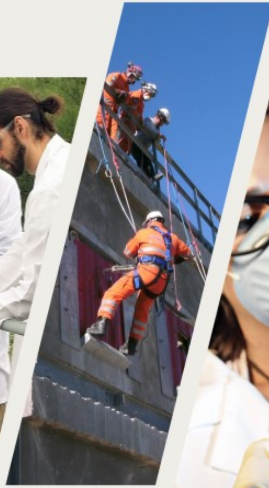
Fire & Emergency Services