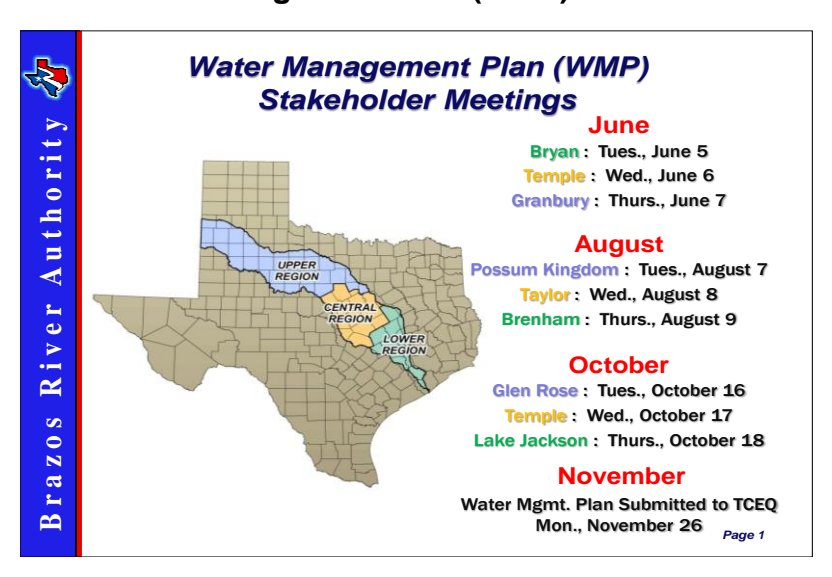
Figure 1.3: Water Management Plan (WMP) Stakeholder Meetings

For the initial round of meetings in June, the BRA sent out nearly 1,500 letters to water right holders, BRA customers, elected officials, councils of government, and regional water planning groups throughout the basin, informing them of the first meetings and their times and locations. For the second round of meetings in August, in addition to being announced in the weekly website e-mail "blasts" for those who had registered an e-mail address with BRA, a postcard reminder was mailed to the same roughly 1,500 individuals who received the first invitations. Finally, for the October meetings, the same mail and e-mail approach was used, to both the original list expanded through participation in the August meetings, as well as anyone who had registered their e-mail address subsequent to the meetings.