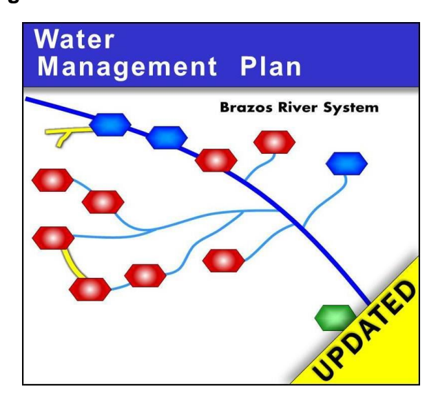
Figure 1.5 - Dedicated WMP Website Access

The stakeholder process also included development of a special section or mini-site within the BRA website, dedicated solely to the WMP. The mini-site was developed with a unique ability for the public not only to view documents, but also to post comments/questions and receive answers about the WMP. The site is accessible by clicking the WMP icon/logo posted on the BRA home page (Figure 1.5) and went live on May 18, 2012.