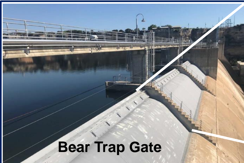
Bear Trap Gate

Morris Sheppard Dam creates Possum Kingdom Lake. The dam utilizes 9 Bear Trap gates to control the release of water. Each gate has a chamber underneath with smaller gates that allow water in and out of the gate chamber. Each chamber houses one roller gate and actuator that allows water into the chamber (“floating the gate”) and one slide gate and actuator that allows water out. The hydraulic process of allowing water in and out of the chamber enables dam operators to lower and raise a Bear Trap gate to control the reservoir level.