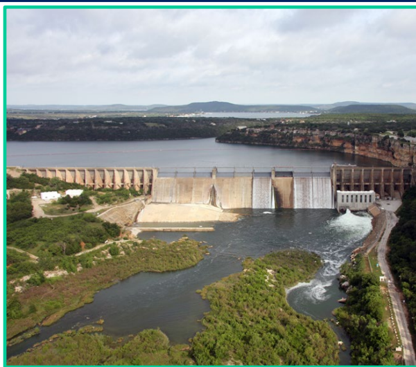
Morris Sheppard Dam Possum Kingdom Lake

The Risk-Based Asset Management and Capital Planning Program formalizes the process to define the relative risk posed to operations from any single asset, as well as assess the BRA's risk profile presented by all assets. The program will leverage data collected from operations, financial software system and other various sources to integrate into an enterprise resource planning system. This will help improve decision making on asset renewal through improved prioritization of assets across BRA and also improve long-term capital forecasting efforts through improved assessment of renewal needs.