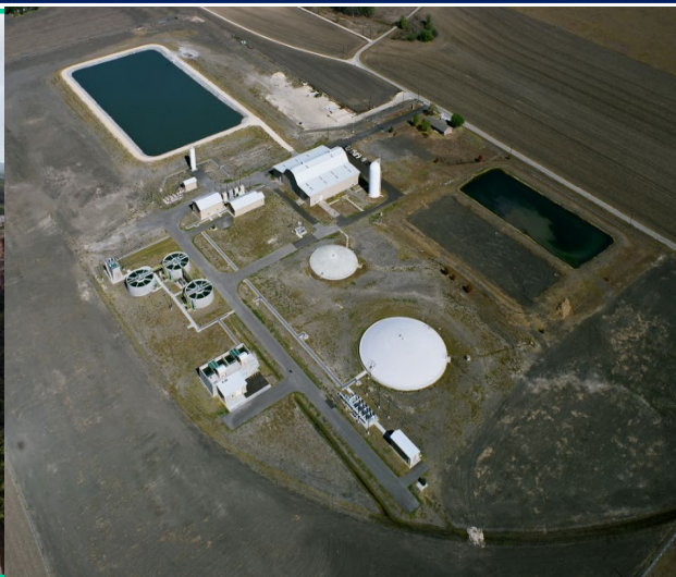
East Williamson County Water System

The Risk-Based Asset Management and Capital Planning Program formalizes the process to define the relative risk posed to operations from any single asset, as well as assess the BRA's risk profile presented by all assets. The program will leverage data collected from operations, financial software system and other various sources to integrate into an enterprise resource planning system. This will help improve decision making on asset renewal through improved prioritization of assets across BRA and also improve long-term capital forecasting efforts through improved assessment of renewal needs.