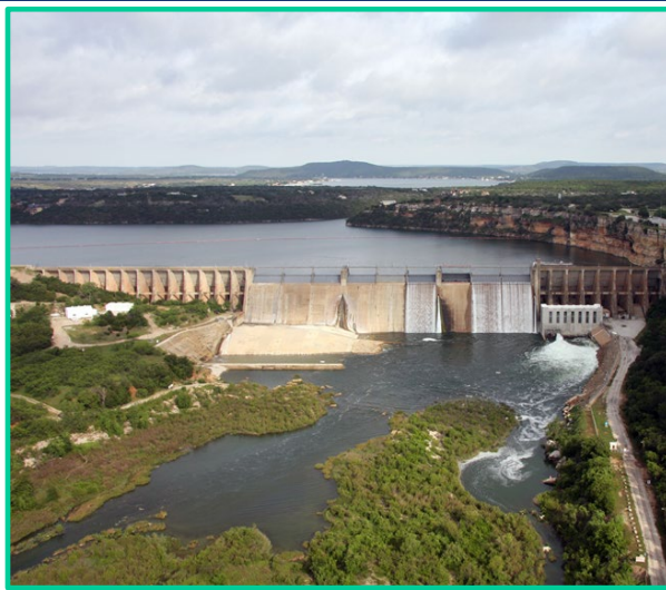
Morris Sheppard Dam Possum Kingdom Lake

The Risk-Based Asset Management and Capital Planning Program formalizes the process to define the relative risk posed to operations from any single asset, as well as assess the BRA's risk profile presented by all assets. The program will leverage data collected from operations, financial software system and other various sources to integrate into an enterprise resource planning system. This will help improve decision making on asset renewal through improved prioritization of assets across BRA and also improve long-term capital forecasting efforts through improved assessment of renewal needs.