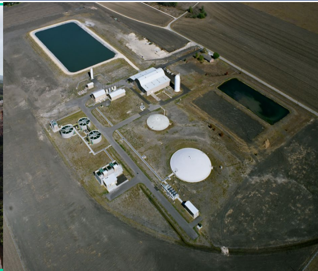
East Williamson County Water System

The Risk-Based Asset Management and Capital Planning Program formalizes the process to define the relative risk posed to operations from any single asset, as well as assess the BRA's risk profile presented by all assets. The program will leverage data collected from operations, financial software system and other various sources to integrate into an enterprise resource planning system. This will help improve decision making on asset renewal through improved prioritization of assets across BRA and also improve long-term capital forecasting efforts through improved assessment of renewal needs.