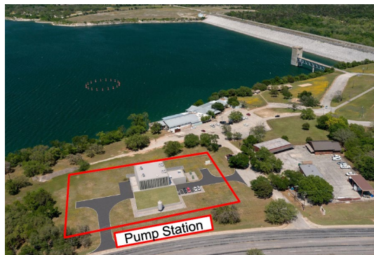
Architect rendering of proposed water intake facility at Lake Belton (facing north).

In 2005, the BRA authorized additional water supply contracts from Lakes Belton and Stillhouse Hollow to meet future demands in Bell, Burnet, Coryell, Falls, Lampasas, and Williamson counties. To meet these demands during times of drought, a raw water transfer system is required to manage this portion of the water supply system to ensure water can be accessed when and where it is needed.