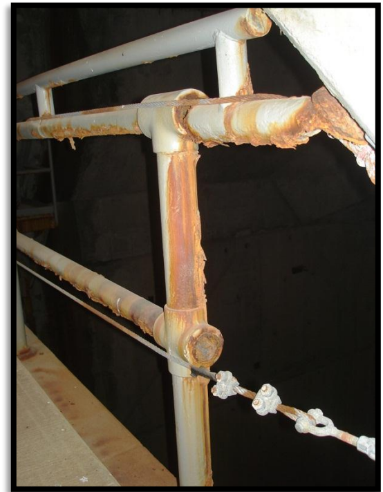
Temporary cables to support handrails