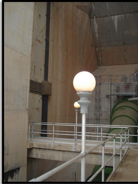
Location of new staircase; will allow access to electrical panels and catwalk if elevator inoperable