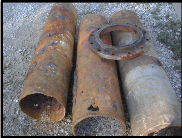
Segments of replaced pipe